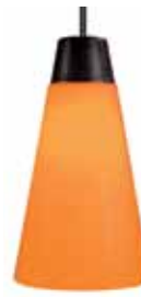
Tangerine Shade (TF) with Short Retro Cup in Black (RSB)