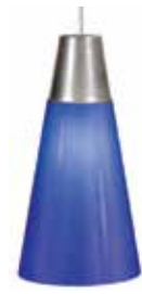
Cobalt Shade (CF) with Retro Cup in Pewter (RP)