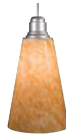
Yellow Frit Shade (YWOG) with Traditional Cup in Pewter (TP)